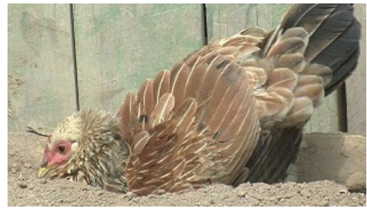
Taking care of local chickens