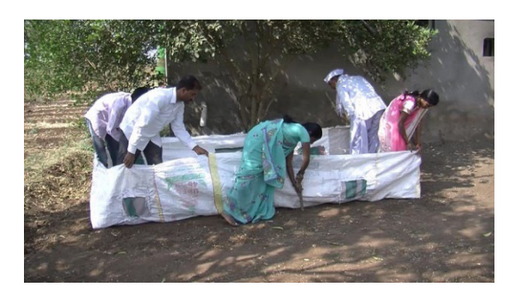
Making a vermicompost bed